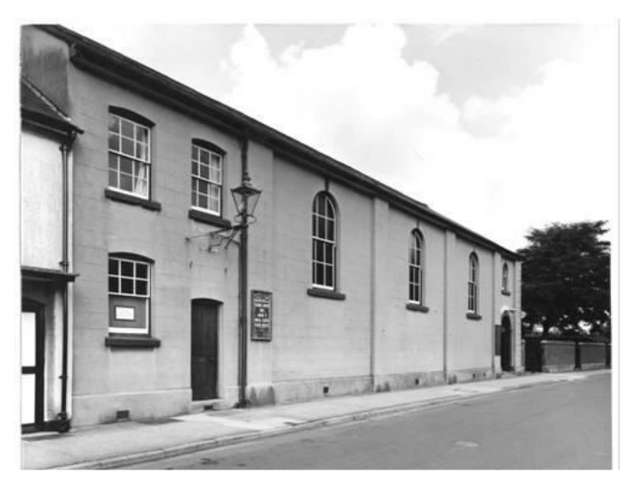
Barton Hall in the 1920s —note the gas lamp.